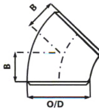
45° SR ELBOW